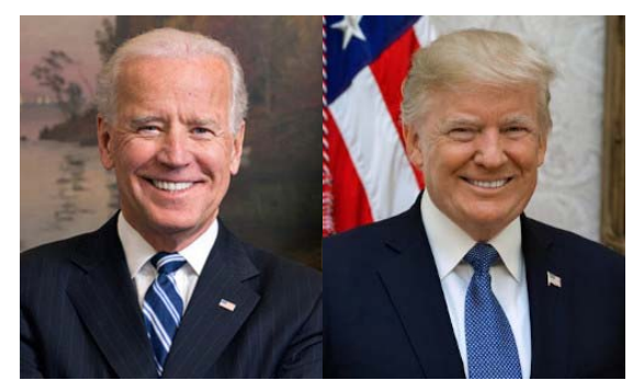
President and Vice President of the United States

Click a county name on the map to jump to that race result.