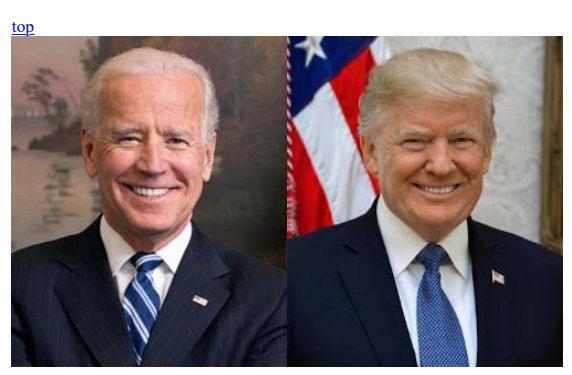
BIDEN, JOSEPH R. TRUMP, DONALD J. (Incumbent)